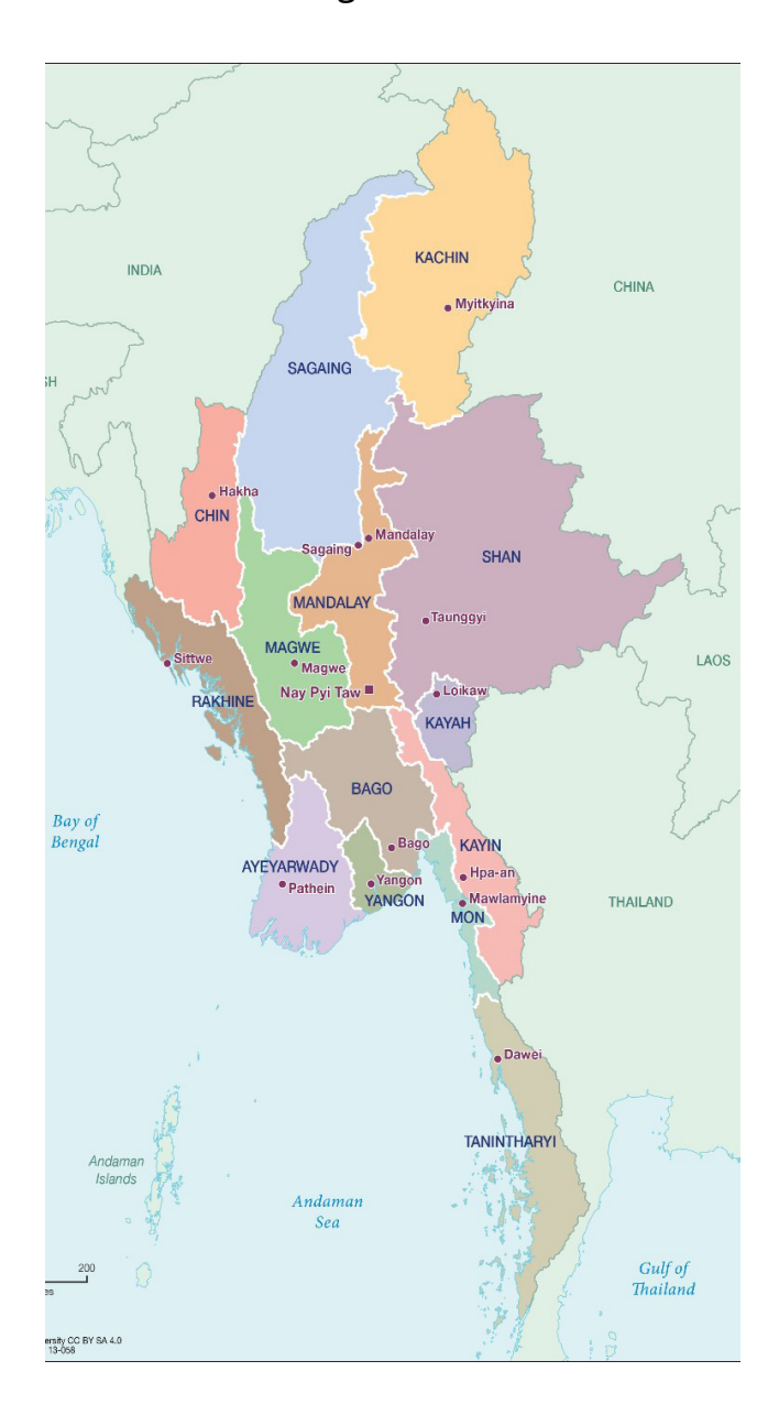
Figure 2: Map of Myanmar's States and Regions