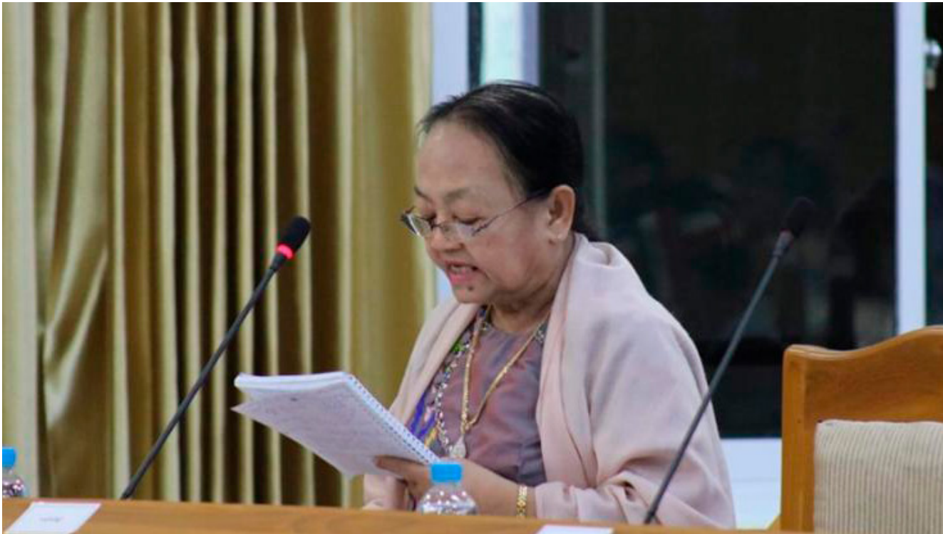
Mon State Chief Auditor presents the report to the hluttaw.