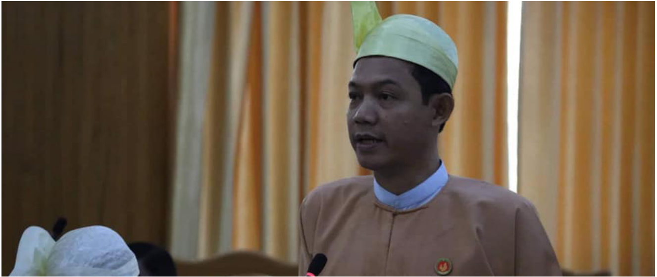
Minister of Immigration and Human Resources, U Tun Min Aung,