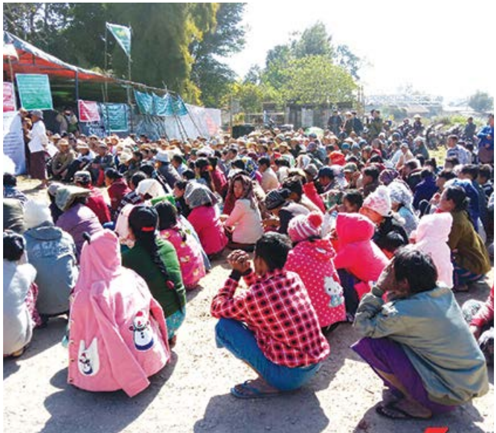
Local farmers are protesting against the Regional Member of Parliament of Pyin Oo Lwin Township

According to U Aung Min, the Member of Parliament, there are over 600 cases of land grabbing in Pyin Oo Lwin complained to Farmland Review Committee during the time of the present government. Among them, over 100 cases are reported to Regional level and have been solved.