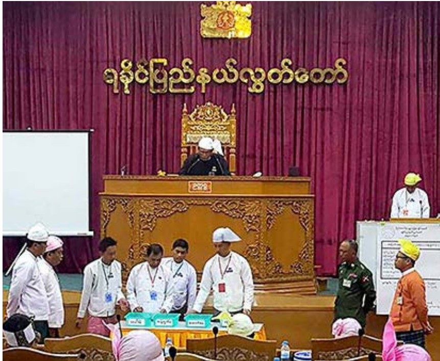
U Min Aung, the Minister (the man wearing Burmese-style Pin Ni Jacket), is watching while counting the votes.