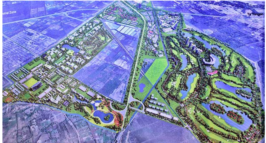
Model of Eco Green City Housing Project

That project was reported as a supplement when the Regional Hluttaw made confirmation for the projects and the budgets. But, as the detailed information of the project was not reported to Hluttaw, it was decided to do so by committee meeting. That project will be implemented by